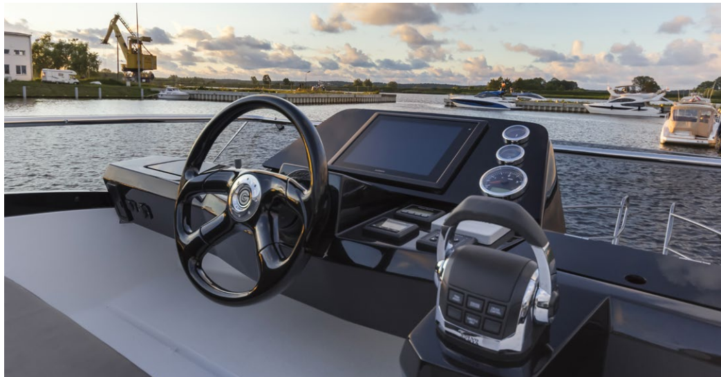
Helm station on the flybridge