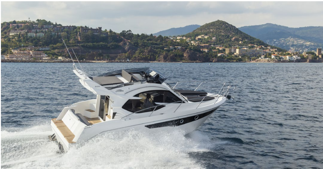
Swift handling in any conditions