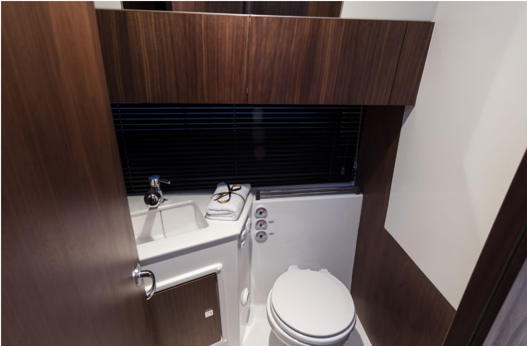
Bathroom with head and shower