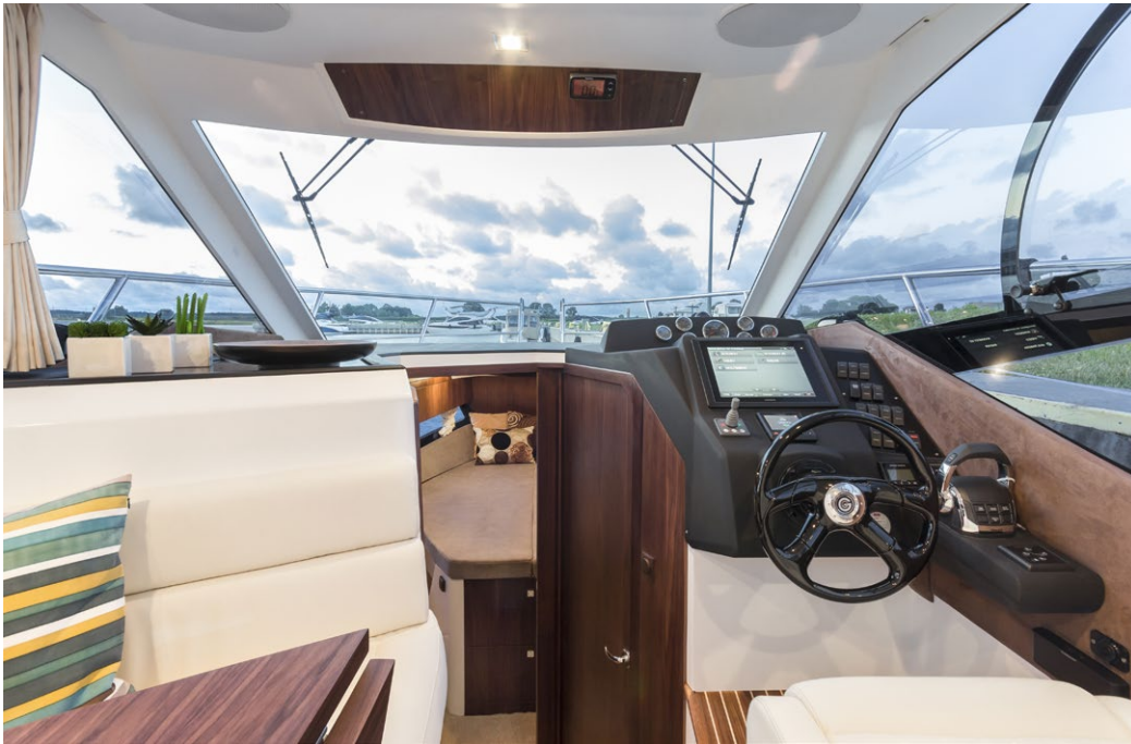
The side window will open manually to let the breeze in