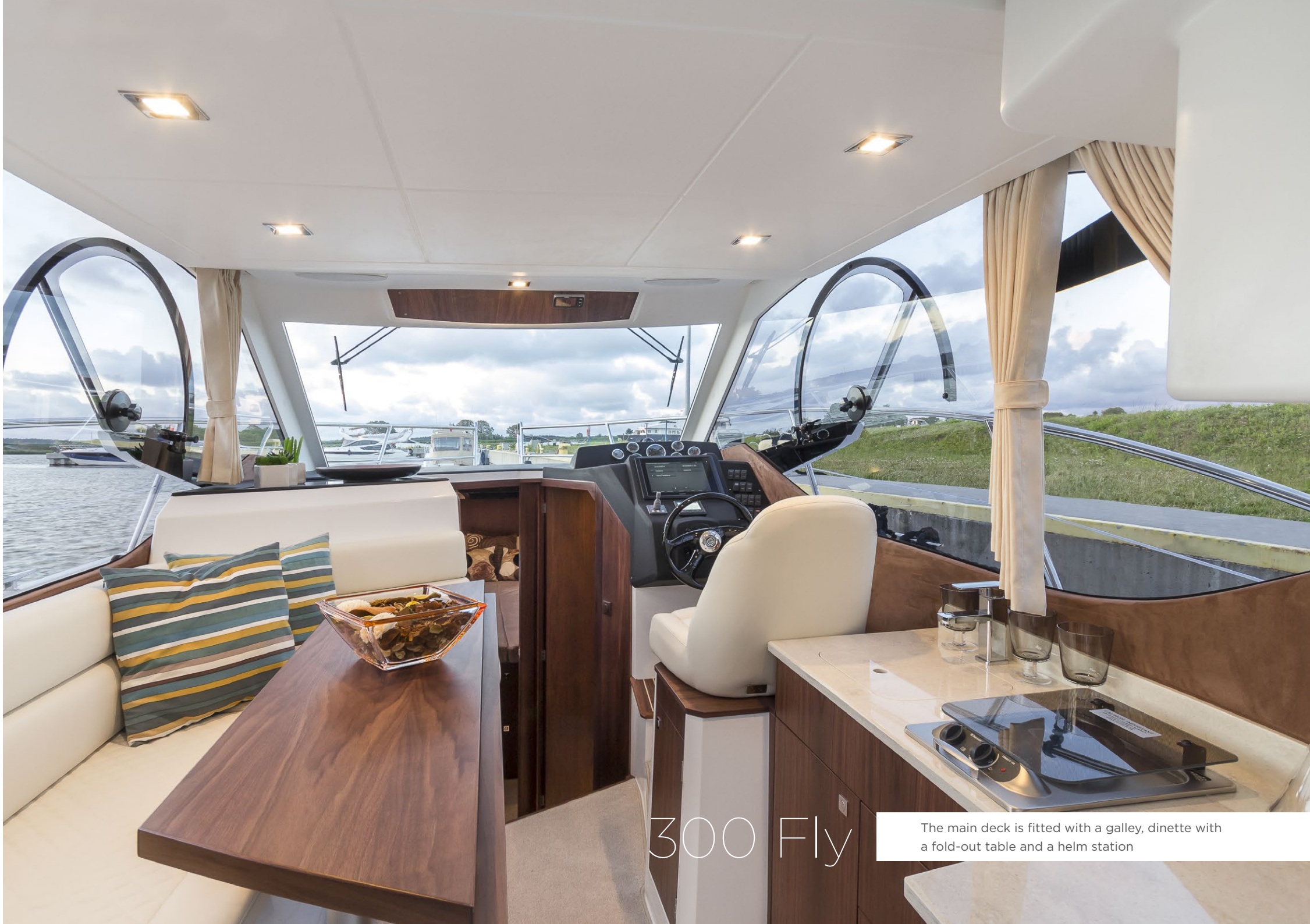
The main deck is fitted with a galley, dinette with a fold-out table and a helm station