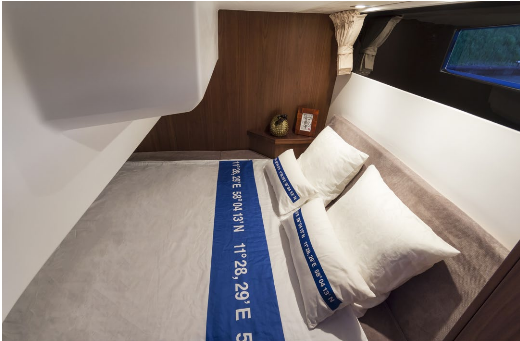
The guest quarters will sleep two in comfort